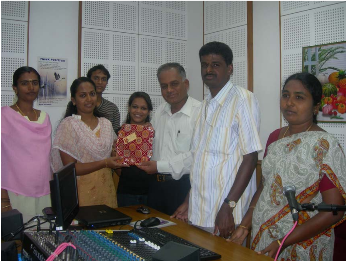
Image Building Should be an integral part